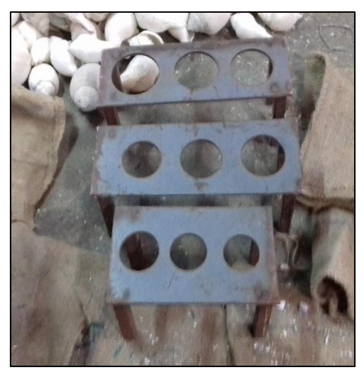
Fig. 3: Measuring gauge