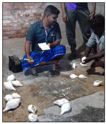
Fig. 2: Collection of chanks by traders from fishers