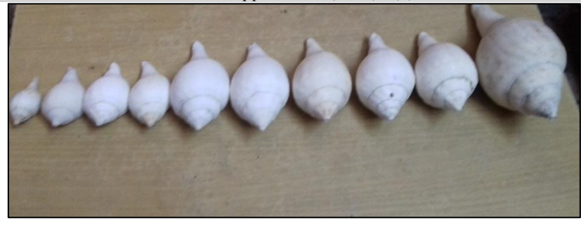
Fig. 4: Turbinella pyrum (Sacred Chank)